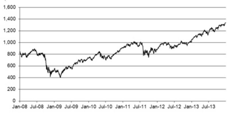
S&P MidCap 400® Historical Performance – Daily Index Closing Values January 2, 2008 to December 30, 2013

License Agreement between Standard & Poor's and J.P. Morgan Securities LLC. "Standard & Poor's®," "S&P®," "S&P MidCap 400®" and "Standard & Poor's 500" are trademarks of Standard & Poor's. and have been licensed for use by J.P. Morgan Securities LLC. See "Equity Index Descriptions — The S&P MidCap 400® Index — License Agreement with S&P" in the accompanying underlying supplement no. 1-I.