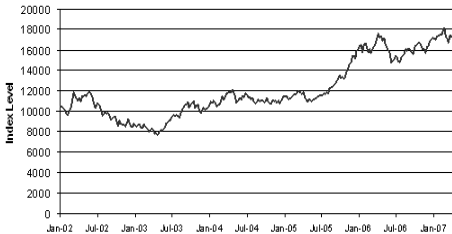
Historical Performance of the Nikkei 225 Index