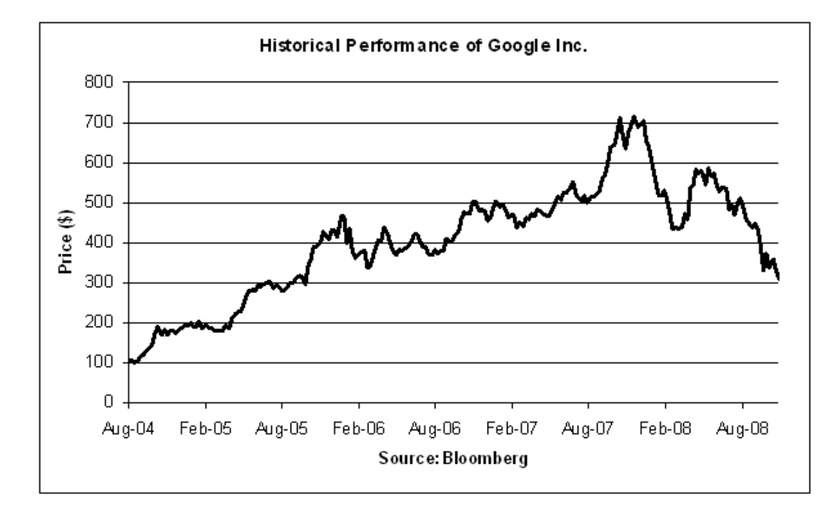
JPMorgan Structured Investments -

Since its inception, the price of the common stock of Google has experienced significant fluctuations. The historical performance of the common stock of Google should not be taken as an indication of future performance, and no assurance can be given as to the closing prices of the common stock of Google during the term of the notes. We cannot give you assurance that the performance of the common stock of Google will result in the return of any of your initial investment. We make no representation as to the amount of dividends, if any, that Google will pay in the future. In any event, as an investor in the notes, you will not be entitled to receive dividends, if any, that may be payable on the common stock of Google.