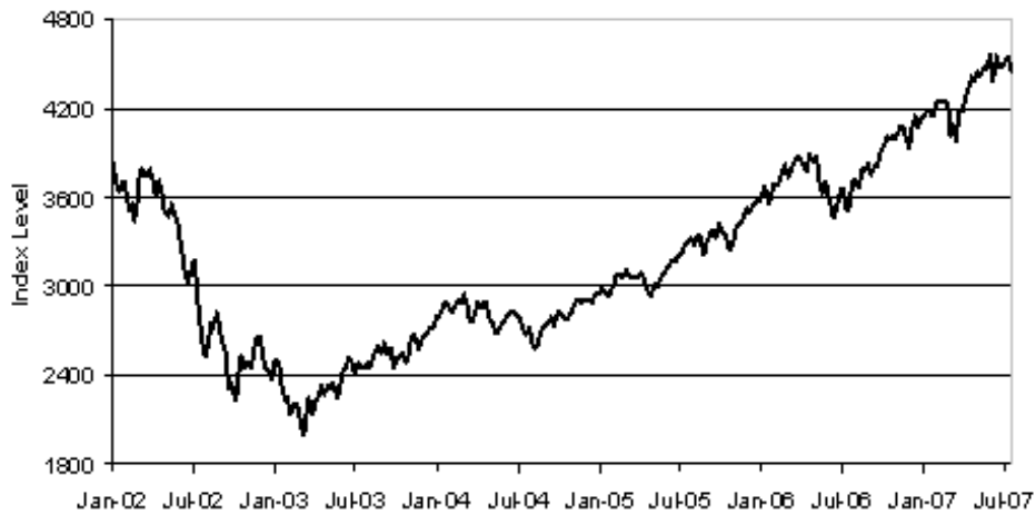
Historical Performance of the Dow Jones EURO STOXX 50® Index