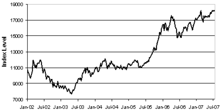
Historical Performance of the Nikkei 225 Index