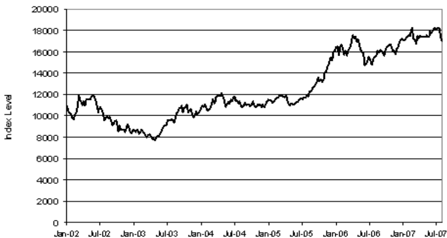
Historical Performance of the Nikkei 225 Index