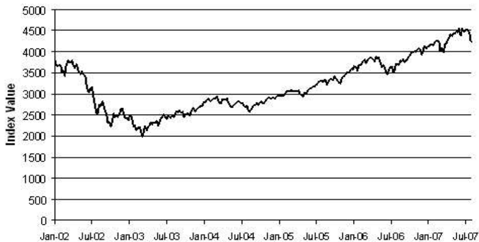
Historical Performance of the Dow Jones EURO STOXX 50 ® Index