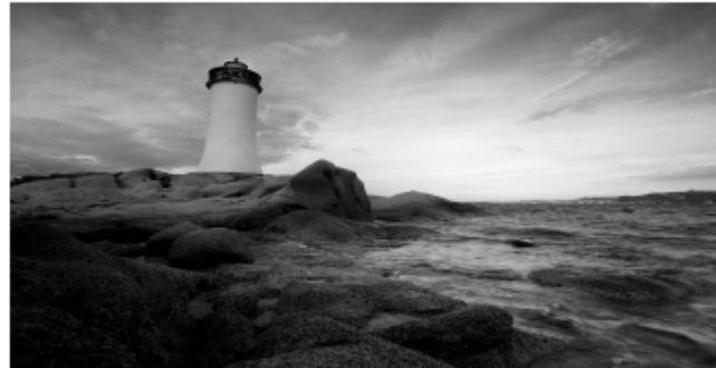
Hypothetical Index Volatility and Leverage (April 30, 2003 to April 30, 2013) 2

The S&P 500® Risk Control 10% Excess Return Index (the "Index") provides investors with a broad U.S. equities index that has the potential for greater stability and lower overall risk when compared to the S&P 500® Total Return Index.