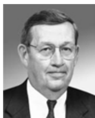
Lee R. Raymond