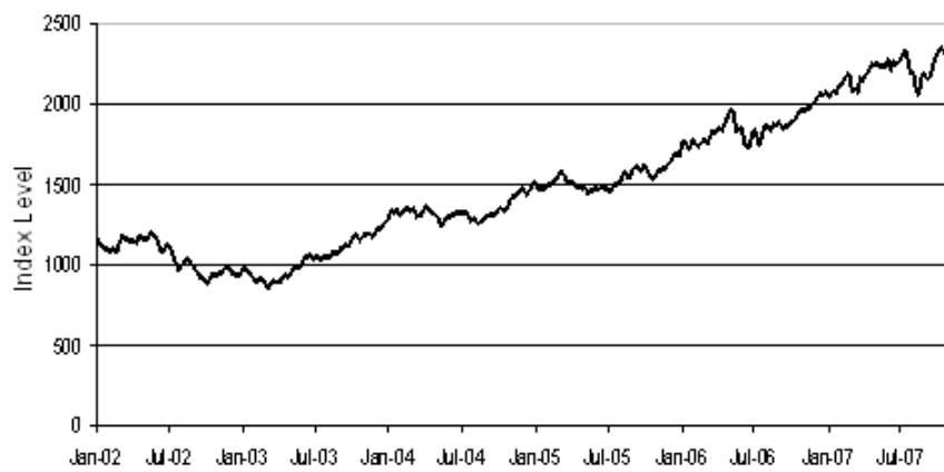
Historical Performance of the MSCI EAFE® Index