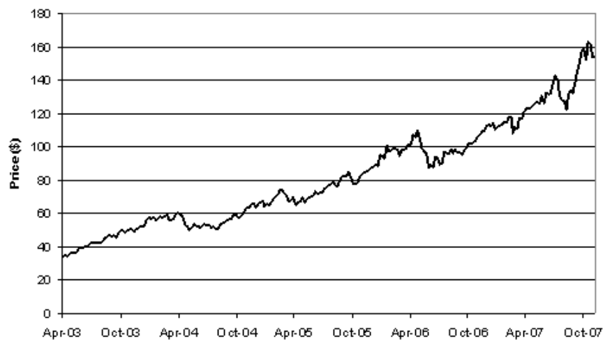
Historical Performance of the iShares® MSCI Emerging Markets Index Fund