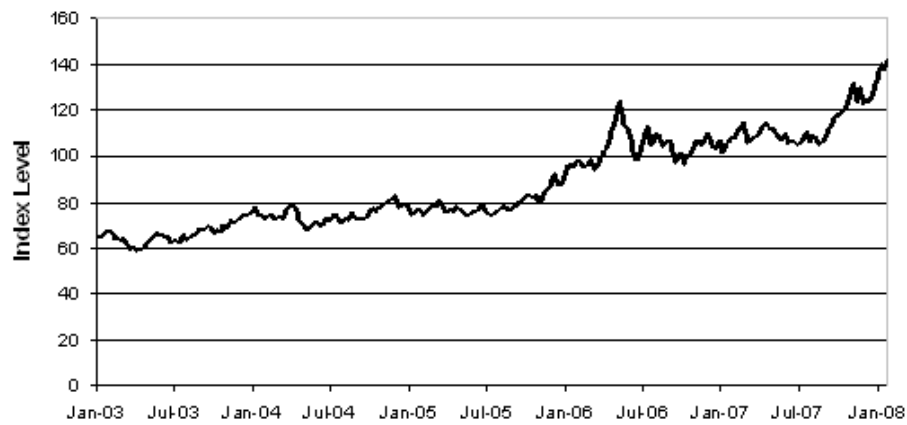
Historical Performance of the S&P GSCI™ Precious Metals Index Excess Return