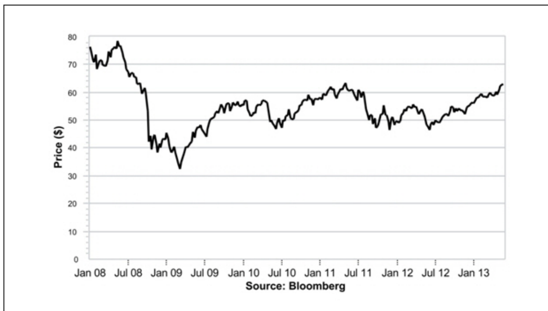
Historical Performance of iShares® MSCI EAFE Index Fund

The historical closing prices per share of the Fund should not be taken as an indication of future performance, and no assurance can be given as to the closing price per share of the Fund on the pricing date or Observation Date. We cannot give you assurance that the performance of the Fund will result in the return of any of your initial investment in excess of $100 per $1,000 principal amount note, subject to the credit risk of JPMorgan Chase & Co.