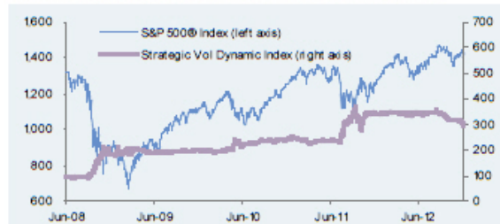
Hypothetical historical returns and volatilities: Strategic Volatility Dynamic Index and S&P 500® Index – Jun 2008 to Apr 2013