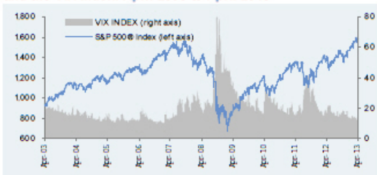
Historical performance comparison of the S&P 500® Index and the VIX Index: April 2003 to April 2013

As of 4/30/2013. PAST PERFORMANCE IS NOT INDICATIVE OF FUTURE RESULTS. The VIX Index is not an investable Index. The Strategic Volatility Dynamic Index is not linked to the VIX Index. The information in this chart is provided solely for reference.