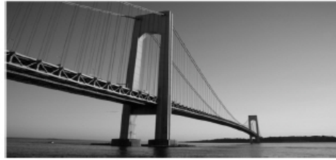
Hypothetical and Actual Historical Volatility – October 29, 2003 to April 30, 2013

The J.P. Morgan ETF Efficiente DS 5 Index (the "Index") is a J.P. Morgan strategy that seeks to generate returns through tracking the excess returns of exchange traded funds ("ETFs") and a cash index to provide exposure to a broad range of asset classes and geographic regions. The Index targets 5% volatility on a daily basis by varying the exposure it takes to a basket of 12 ETFs and a cash index whose weights are allocated monthly in accordance with a rules-based methodology (the "Monthly Reference Portfolio"). The Index increases its exposure to the Monthly Reference Portfolio when the volatility of the portfolio decreases and decreases the exposure when the volatility of the Monthly Reference Portfolio increases. The Index levels incorporate a daily deduction fee of 1.00% per annum.