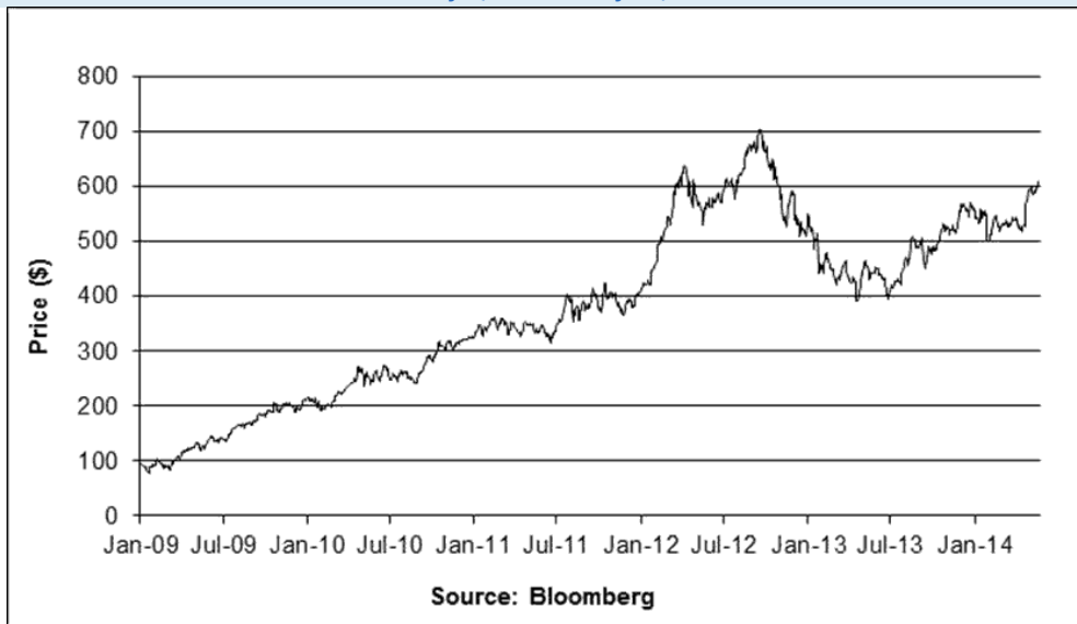
The Common Stock of Apple Inc. – Daily Closing Prices January 2, 2009 to May 22, 2014

This document relates only to the securities offered hereby and does not relate to the underlying stock or other securities of Apple Inc. We have derived all disclosures contained in this document regarding the common stock of Apple Inc. from the publicly available documents described in the preceding paragraph, without independent verification. In connection with the offering of the securities, neither we nor the agent has participated in the preparation of such documents or made any due diligence inquiry with respect to Apple Inc. Neither we nor the agent makes any representation that such publicly available documents or any other publicly available information regarding Apple Inc. is accurate or complete. Furthermore, we cannot give any assurance that all events occurring prior to the date hereof (including events that would affect the accuracy or completeness of the publicly available documents described in the preceding paragraph) that would affect the trading price of the underlying stock (and therefore the price of the underlying stock at the time we price the securities) have been publicly disclosed. Subsequent disclosure of any such events or the disclosure of or failure to disclose material future events concerning Apple Inc. could affect the value received at maturity with respect to the securities and therefore the trading prices of the securities.