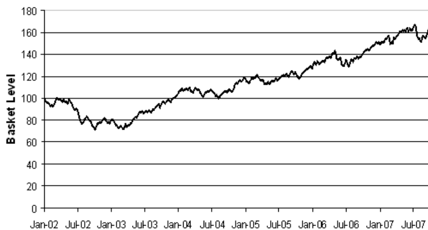
Historical Performance of the Basket