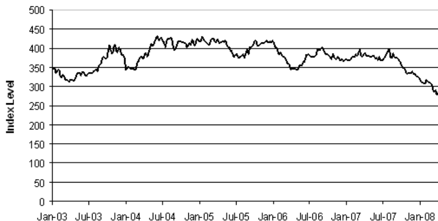
Historical Performance of the S&P GSCI™ Livestock Index Excess Return