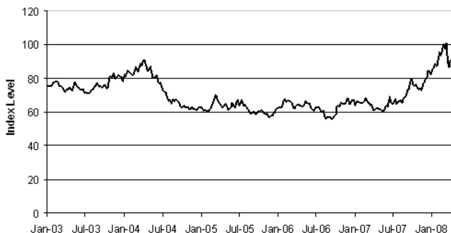
Historical Performance of the S&P GSCI™ Agriculture Index Excess Return