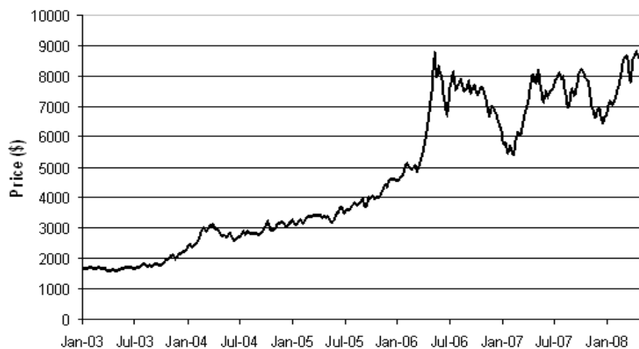
Historical Performance of Copper