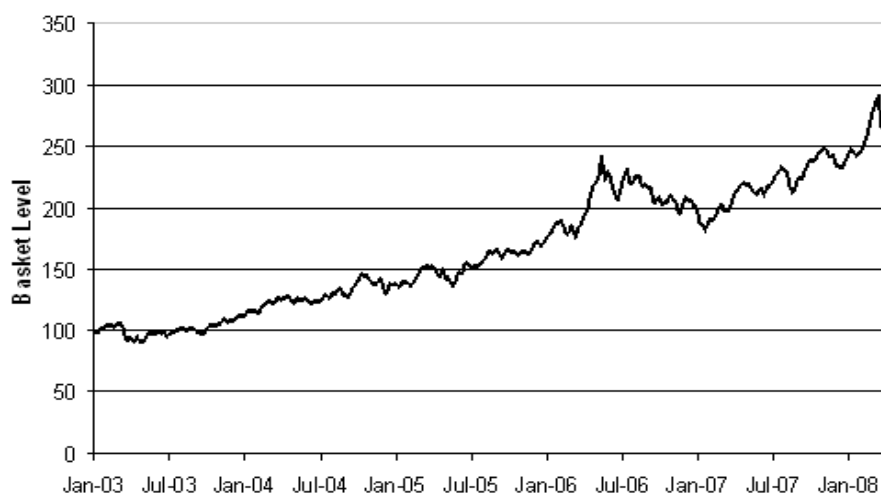
Historical Performance of the Basket