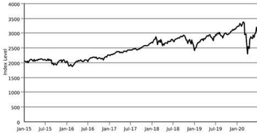
Historical Performance of the S&P 500® Index