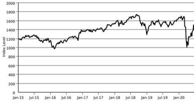
Historical Performance of the Russell 2000® Index