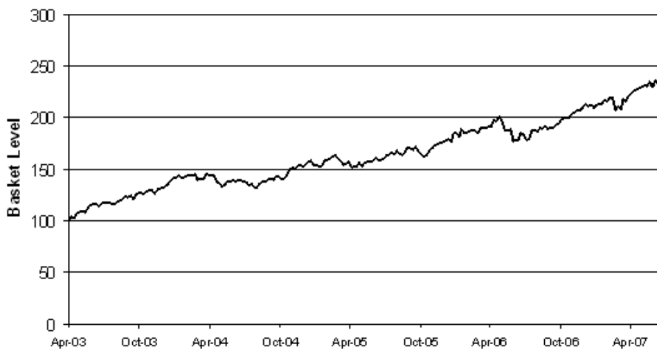
Historical Performance of the Basket