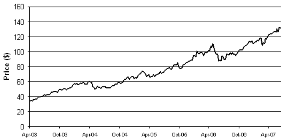
Historical Performance of the iShares® MSCI Emerging Markets Index Fund