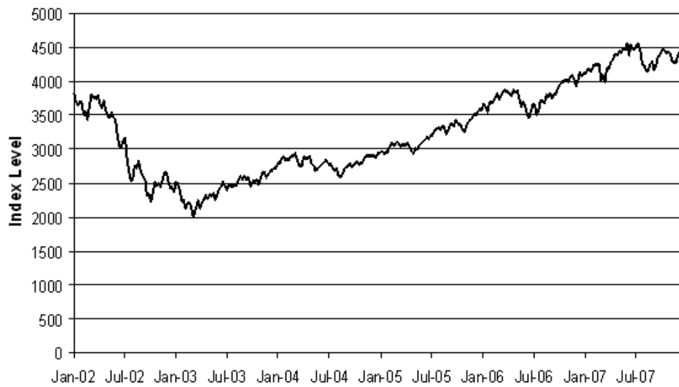
Historical Performance of the Dow Jones EURO STOXX 50® Index