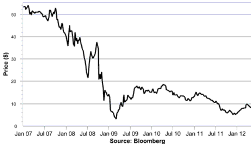
Historical Performance of Bank of America Corporation

Since its inception, the price of the common stock of Bank of America has experienced significant fluctuations. The historical performance of the common stock of Bank of America should not be taken as an indication of future performance, and no assurance can be given as to the closing prices of the common stock of Bank of America during the term of the notes. We cannot give you assurance that the performance of the common stock of Bank of America will result in the return of any of your initial investment. We make no representation as to the amount of dividends, if any, that Bank of America will pay in the future. In any event, as an investor in the notes, you will not be entitled to receive dividends, if any, that may be payable on the common stock of Bank of America.