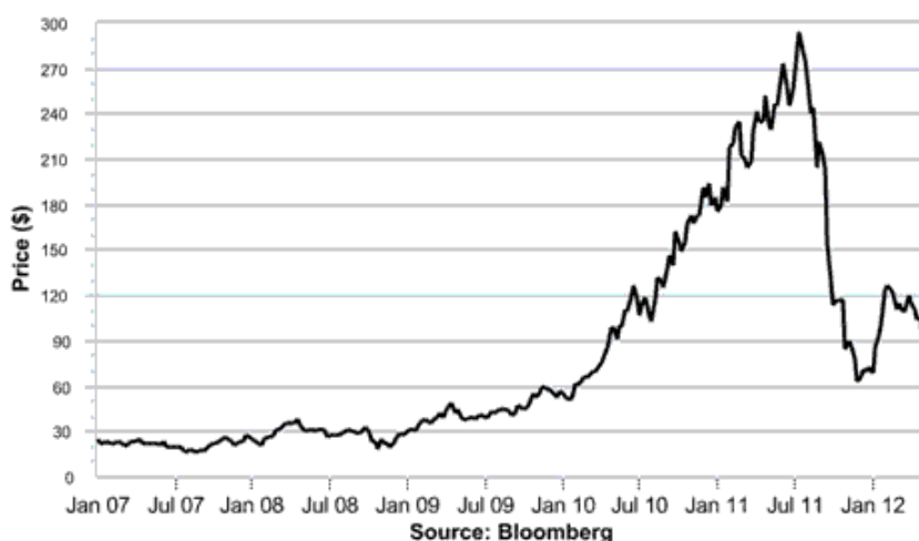
Historical Performance of Netflix, Inc.

Since its inception, the price of the common stock of Netflix has experienced significant fluctuations. The historical performance of the common stock of Netflix should not be taken as an indication of future performance, and no assurance can be given as to the closing prices of the common stock of Netflix during the term of the notes. We cannot give you assurance that the performance of the common stock of Netflix will result in the return of any of your initial investment. We make no representation as to the amount of dividends, if any, that Netflix will pay in the future. In any event, as an investor in the notes, you will not be entitled to receive dividends, if any, that may be payable on the common stock of Netflix.