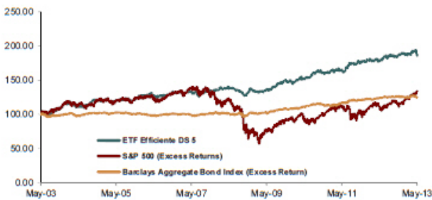
Hypothetical and Actual Historical Performance – May 30, 2003 to May 31, 2013