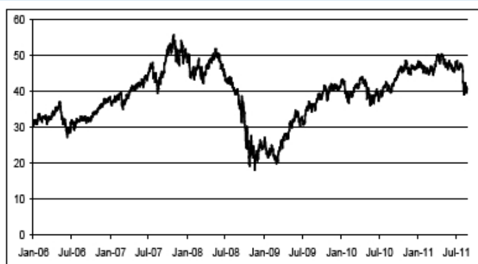
iShares ® MSCI Emerging Markets Index Fund – Daily Closing Price January 3, 2006 to August 24, 2011