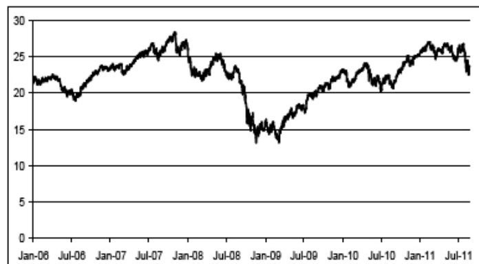
Technology Select Sector SPDR® Fund – Daily Closing Price January 3, 2006 to August 24, 2011