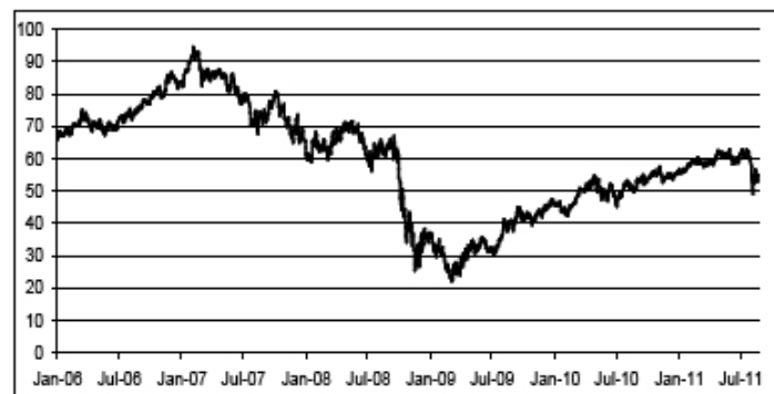
iShares® Dow Jones U.S. Real Estate Index Fund – Daily Closing Price January 3, 2006 to August 24, 2011