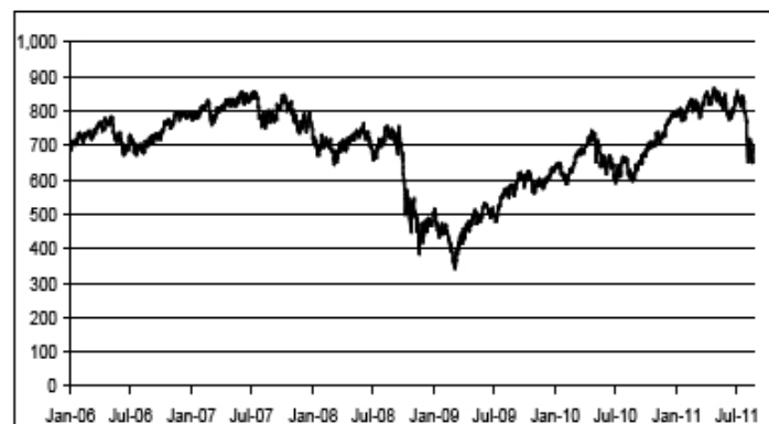
Russell 2000® Index – Daily Closing Level January 3, 2006 to August 24, 2011