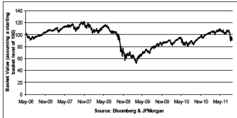
Basket Historical Performance – Daily Closing Price May 3, 2006 to August 24, 2011

The graph is calculated to show the performance of the basket during the period from May 3, 2006 through August 24, 2011, assuming the basket components are weighted as set out above such that the initial basket value was 100 and illustrates the effect of the offset and/or correlation among the basket components during such period. The graph does not take into account the leverage factor or the maximum payment at maturity on the PLUS, nor does it attempt to show your expected return on an investment in the PLUS. The historical values of the basket should not be taken as an indication of its future performance.