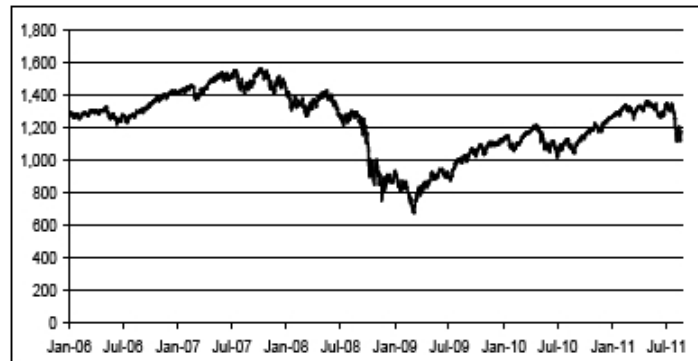
S&P 500® Index – Daily Closing Level January 3, 2006 to August 24, 2011