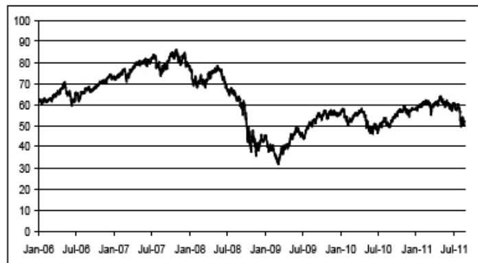
iShares® MSCI EAFE Index Fund – Daily Closing Price January 3, 2006 to August 24, 2011