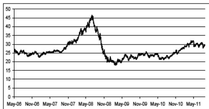
PowerShares DB Commodity Index Tracking Fund – Daily Closing Price May 3, 2006* to August 24, 2011

*The DBC Shares commenced trading on May 3, 2006.