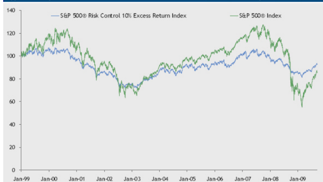
Hypothetical performance of the S&P 500® Risk Control Index (Jan. 4, 1999–Sept. 30, 2009)

The following graph sets forth the historical performance of the S&P 500® Index from January 4, 1999 through September 30, 2009 and the performance of the S&P 500 Risk Control Index based on hypothetical back-tested closing levels from January 4, 1999 through May 13, 2009, and actual historical closing levels from May 14, 2009 through September 30, 2009. Over this period, the S&P 500 Risk Control Index had annualized returns of -0.74% with an annualized volatility of 9.95% in comparison to the S&P 500® Index which had annualized returns of -1.50% with an annualized volatility of 22.01%. There is no guarantee that the S&P 500 Risk Control Index will outperform the S&P 500® Index, or any alternative strategy during the term of your investment in securities linked to the S&P 500 Risk Control Index.