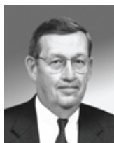
Lee R. Raymond, 72, Retired Chairman and Chief Executive Officer of Exxon Mobil Corporation, oil and gas. Director since 2001 and Director of J.P. Morgan & Co. Incorporated from 1987 to 2000.

Mr. Raymond was Chairman of the Board and Chief Executive Officer of ExxonMobil from 1999 until he retired in December 2005. ExxonMobil's principal business is energy, involving exploration for and production of crude oil and natural gas, manufacture of petroleum and petrochemical products, and transportation and sale of crude oil, natural gas, petroleum and petrochemical products. He had been Chairman of the Board and Chief Executive Officer of Exxon Corporation from 1993 until its merger with Mobil Oil Corporation in 1999, having begun his career in 1963 with Exxon. He was a director of Exxon Mobil Corporation (1984-2005).