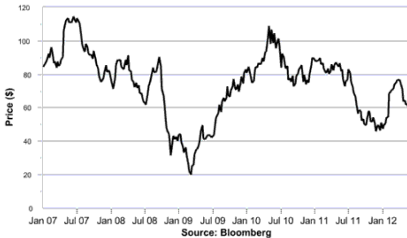
Historical Performance of Whirlpool Corporation

Since its inception, the price of the common stock of Whirlpool has experienced significant fluctuations. The historical performance of the common stock of Whirlpool should not be taken as an indication of future performance, and no assurance can be given as to the closing prices of the common stock of Whirlpool during the term of the notes. We cannot give you assurance that the performance of the common stock of Whirlpool will result in the return of any of your initial investment. We make no representation as to the amount of dividends, if any, that Whirlpool will pay in the future. In any event, as an investor in the notes, you will not be entitled to receive dividends, if any, that may be payable on the common stock of Whirlpool.