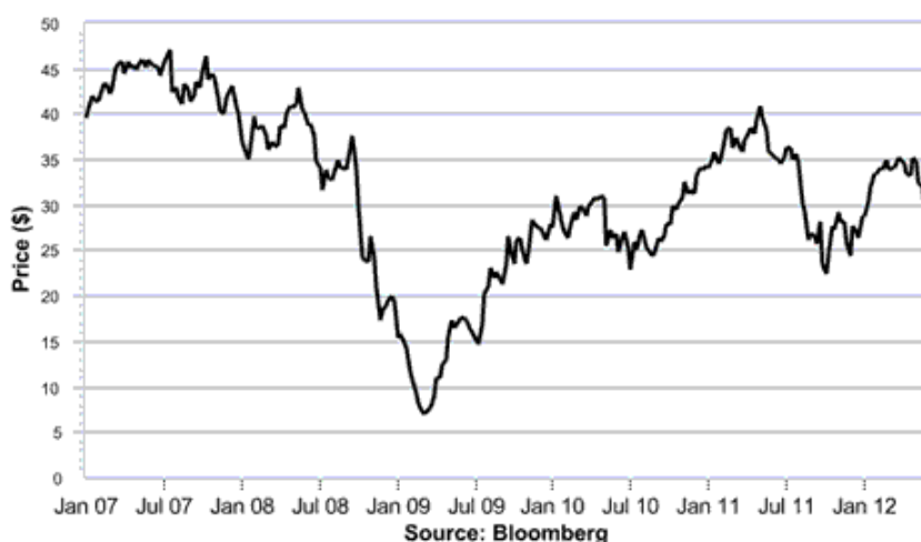
Historical Performance of The Dow Chemical Company

Since its inception, the price of the common stock of Dow Chemical has experienced significant fluctuations. The historical performance of the common stock of Dow Chemical should not be taken as an indication of future performance, and no assurance can be given as to the closing prices of the common stock of Dow Chemical during the term of the notes. We cannot give you assurance that the performance of the common stock of Dow Chemical will result in the return of any of your initial investment. We make no representation as to the amount of dividends, if any, that Dow Chemical will pay in the future. In any event, as an investor in the notes, you will not be entitled to receive dividends, if any, that may be payable on the common stock of Dow Chemical.