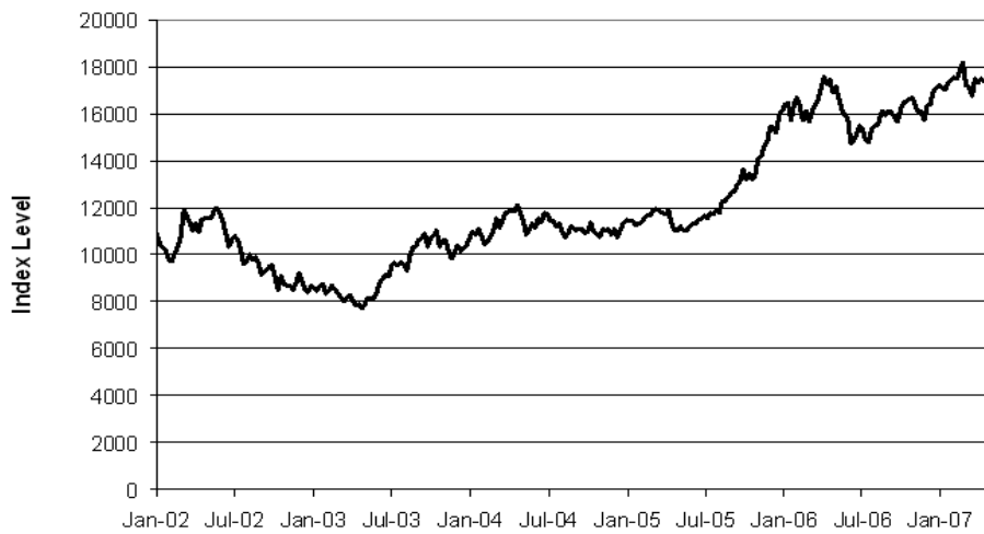
Historical Performance of the Nikkei 225 Index