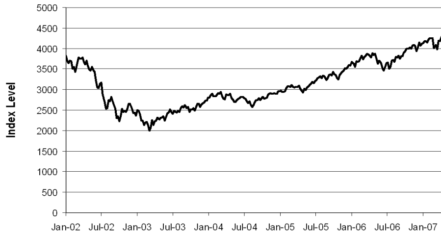
Historical Performance of the Dow Jones EURO STOXX 50® Index