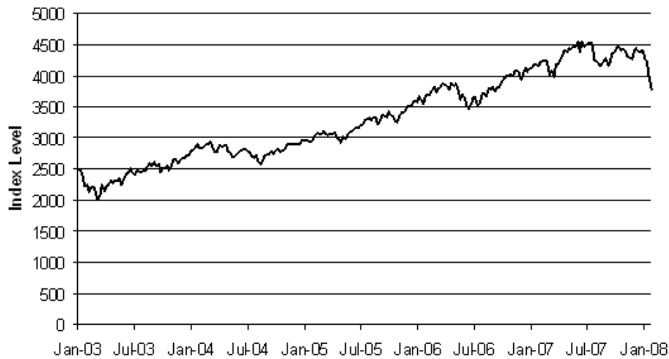
Historical Performance of the Dow Jones EURO STOXX 50® Index