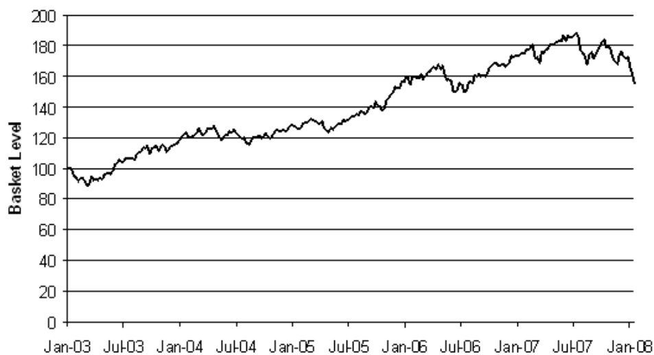
Historical Performance of the Basket