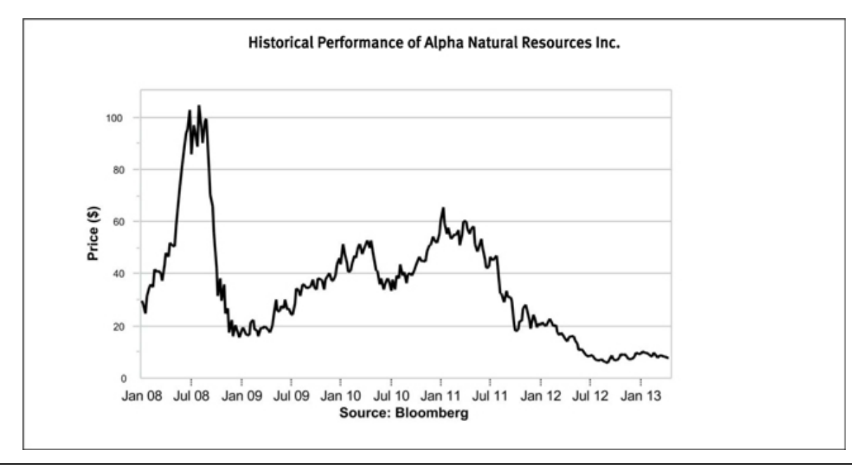
JPMorgan Structured Investments -

Since its inception, the price of the common stock of Alpha Natural Resources has experienced significant fluctuations. The historical performance of the common stock of Alpha Natural Resources should not be taken as an indication of future performance, and no assurance can be given as to the closing prices of the common stock of Alpha Natural Resources during the term of the notes. We cannot give you assurance that the performance of the common stock of Alpha Natural Resources will result in the return of any of your initial investment. We make no representation as to the amount of dividends, if any, that Alpha Natural Resources will pay in the future. In any event, as an investor in the notes, you will not be entitled to receive dividends, if any, that may be payable on the common stock of Alpha Natural Resources.