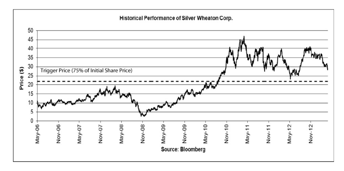
Past performance of the Underlying Stock is not indicative of the future performance of the Underlying Stock.

The graph below illustrates the daily performance of the common shares of Silver Wheaton from May 9, 2006 through April 5, 2013, based on information from Bloomberg, without independent verification. The dotted line represents the Trigger Price, equal to 75% of the closing price on April 5, 2013.