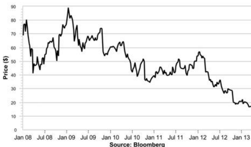
Historical Performance of Apollo Group Inc.

Since its inception, the price of the common stock of Apollo Group has experienced significant fluctuations. The historical performance of the common stock of Apollo Group should not be taken as an indication of future performance, and no assurance can be given as to the closing prices of the common stock of Apollo Group during the term of the notes. We cannot give you assurance that the performance of the common stock of Apollo Group will result in the return of any of your initial investment. We make no representation as to the amount of dividends, if any, that Apollo Group will pay in the future. In any event, as an investor in the notes, you will not be entitled to receive dividends, if any, that may be payable on the common stock of Apollo Group.