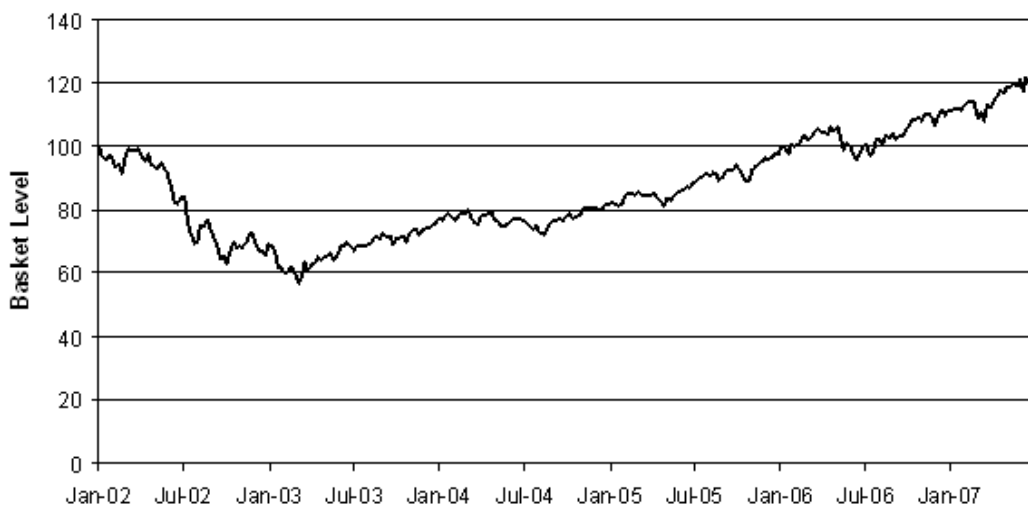
Historical Performance of the Basket